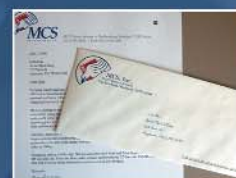
Letter with 2D barcode and Matching Envelope