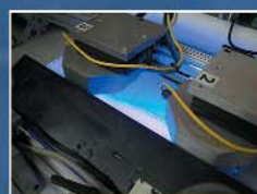
Verify the barcodes on the fly on continuous web