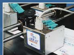
Standard System has two 2" heads