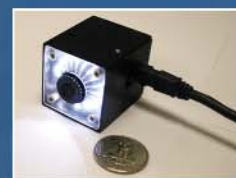
MicroVison™ USB Cameras