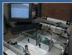
Great for continuous Forms