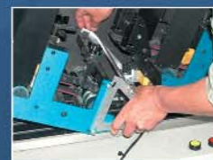
Universal Mounts for most inserters